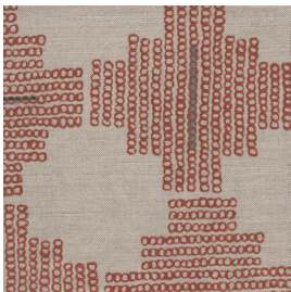
Golden Gate Red

Hand block printed and embroidered in India.